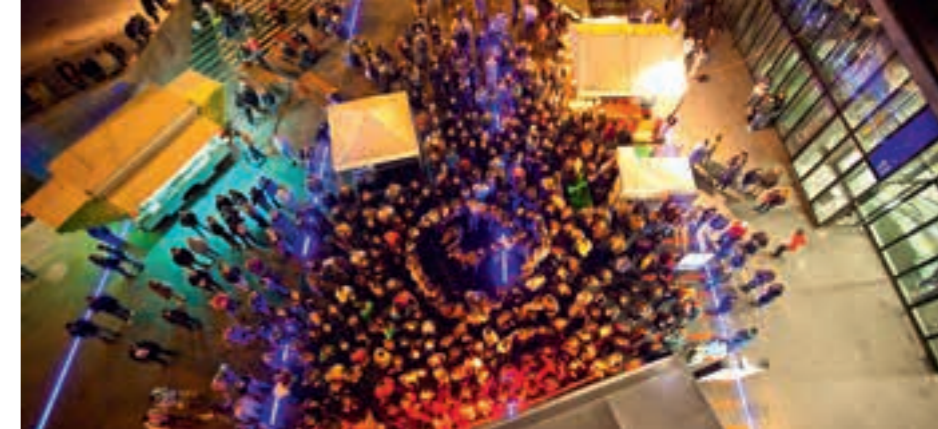
Event in the Flon area, Lausanne