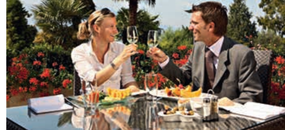
Casino Barrière, Montreux